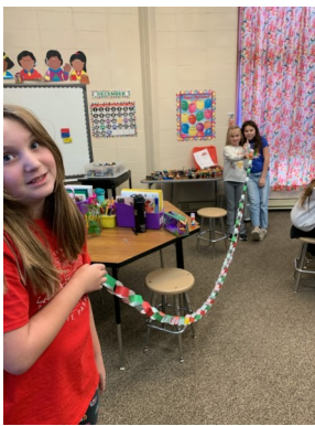
4TH GRADE CREATING AND DECORATING FOR CHRISTMAS

School resumes at 8:20 am on Monday, January 6th, 2025