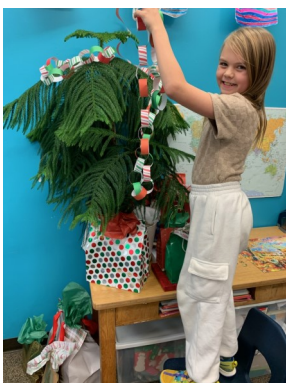
Kindergarten singing Christmas songs and having fun!