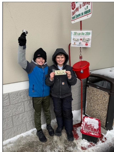
First $20 bill for Salvation Army!